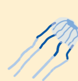
Irukandji Box Jellyfish